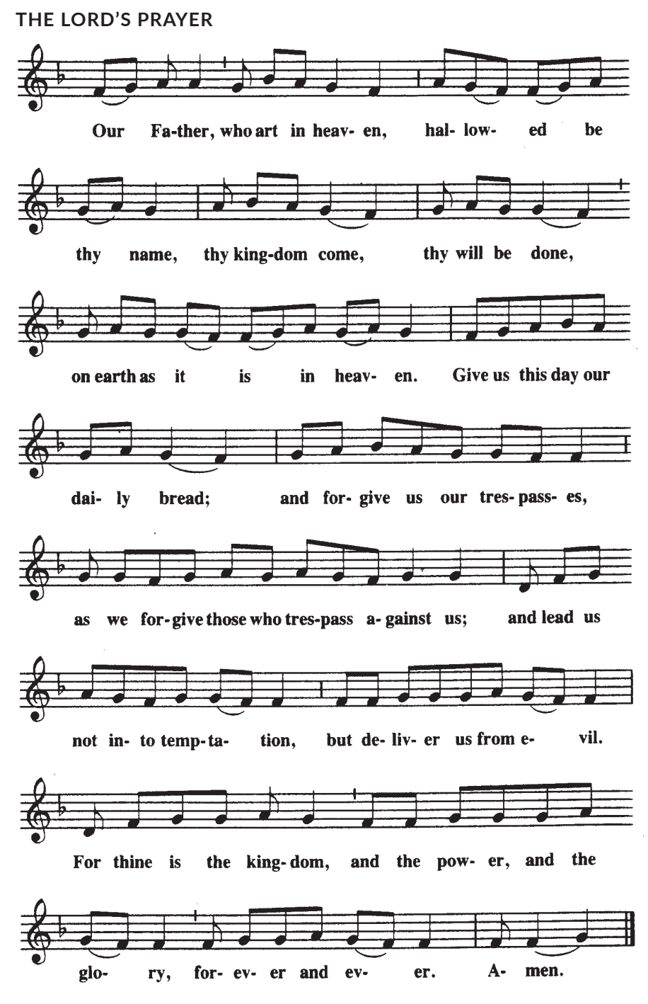
Reprinted by permission under Augsburg Fortress Liturgies Annual License #26456. Hymns reprinted by permission under OneLicense.net #A-703710. New Revised Standard Version Bible, copyright 1989, Division of Christian Education of the National Council of the Churches of Christ in the United States of America. Used by permission. All rights reserved.