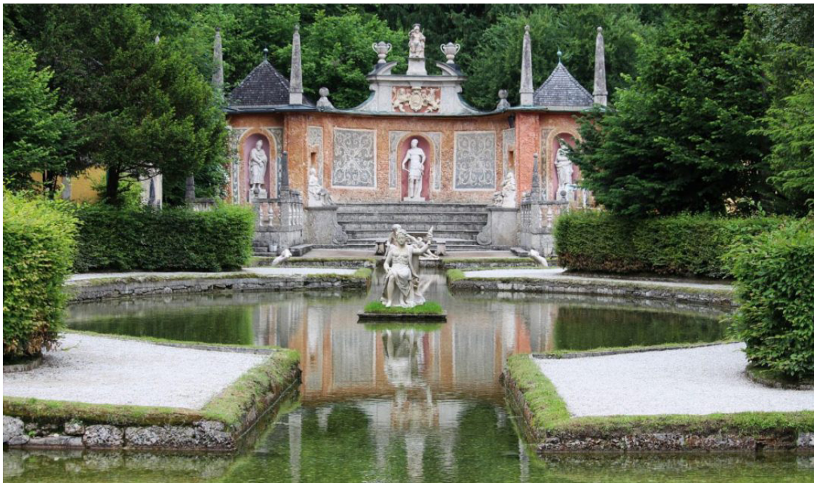
Hellbrunn Palace, Salzburg

Today visit beautiful Salzburg. Learn about about the rich history of this town. Learn about the importance of salt in medieval times, once considered as the “white gold.” Be intrigued by stories and the history about Arch Bishop Wolf Dietrich, one of the most important rulers of Salzburg. Learn about Wolfgang Amadeus Mozart. Visit the Dome In Salzburg. Then, of course, experience some of the sights of the movie “Sound of Music,” like the famous fountain in the Mirabel gardens and the Gazebo at Castle Hellbrunn. Visit and experience also the famous Waterpark of Hellbrunn, built in 1750. You will be entertained. Organ Recital possible in Salzburg TBA. Dinner is included tonight. Overnight in the Salzburg area