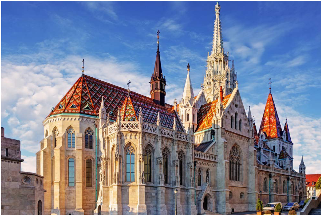
St. Matthias Church, Budapest

Dinner on own tonight. Overnight Budapest.